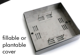
fillable or plantable cover

Inspection chamber of high-quality stainless steel for protection and inspection of roof outlets in intensive green roofs.