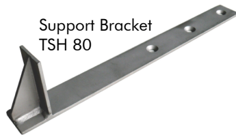
Support Bracket TSH 80

Heavy-duty angle profile made of stainless steel with drainage slots and perforation in the support leg for fixation onto the waterproofing.